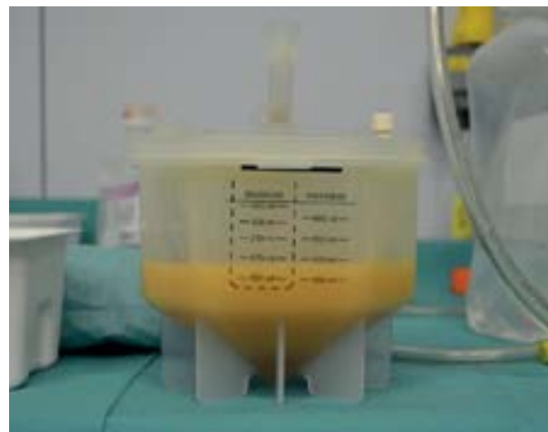
Figure 1: Disaggregated adipose tissue in the GID SVF-1 device, prior to centrifugation.

Assessment of knee pain was done using the Patient Reported Outcomes Measurement Information System (PROMIS) pain instruments, a validated pain scale system developed under funding by the NIH. PROMIS is a system for measurements of patient reported health status for physical, mental, and social well-being, including three measurements of pain [27]. The PROMIS Pain Intensity instrument (3a) assesses how much a person hurts. The PROMIS Pain Behavior instrument (Bank 1.0) measures behaviors that indicate to others that an individual is experiencing pain. The PROMIS Pain Interference instrument (Bank 1.0) measures the consequences of pain on relevant aspects of one's life. Patient responses are converted to numeric values in a validated scale. Responses to each question in a pain instrument range from 1 to 5 (1=not at all, 2=a little bit, 3=somewhat, 4=quite a bit, 5=very much), and are summed over the number of questions in the bank to create a raw score. The raw score is converted to a standardized score using an iterative response method with a mean of 50 and SD of 10, based on a large sample of the general population of the United States. The validated PROMIS pain scales provide interval data and allows calculation of the mean and SD,